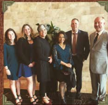
A delegation of staff and farmers from Tillamook County Creamery Association received the U.S. Dairy Sustainability Award for Community Impact.